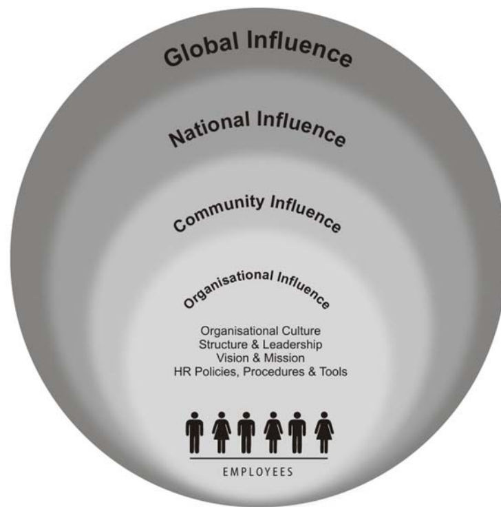
Diagram 3: Employee Motivation – Spheres of Influence 4

Organisational Influence is the main factor in employee motivation. However, no organisation or employee is an island, and both are also affected by the community in which they exist, such as family, friends, community members and local issues affecting the lives of people. It can be argued that National Influence affects both the organisation and the employee evenly. As the organisation must conform to social, political, economic and legal requirements on a national level, the employee must also do the same in order to exist. Global influence is all encompassing; in today's global village ideas are exchanged in a matter of moments. This open exchange of concepts and knowledge set the perimeter for our expectations from us as well as others. Global influence moulds the national influence which, in turn, affects the community. The organisation and the employee must deal with this interplay and tension between the different spheres of influence that affect them.